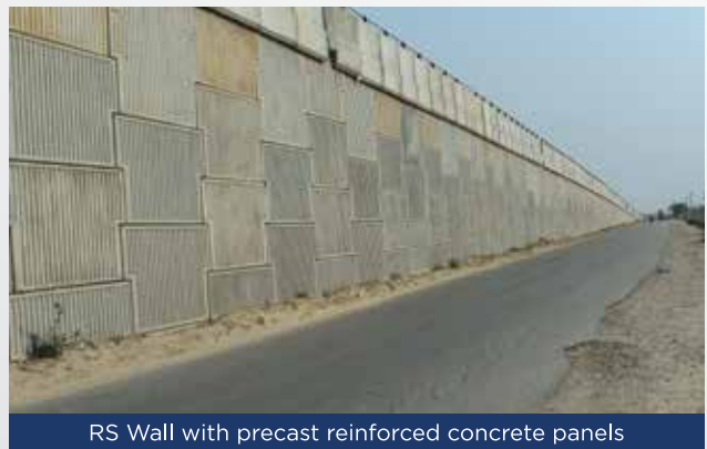
RS Wall with precast reinforced concrete panels