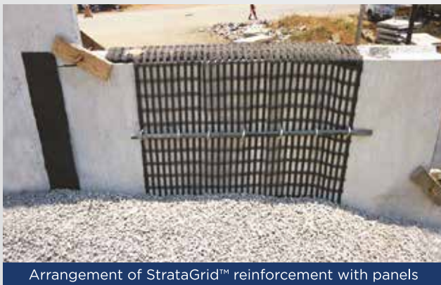
Arrangement of StrataGrid™ reinforcement with panels