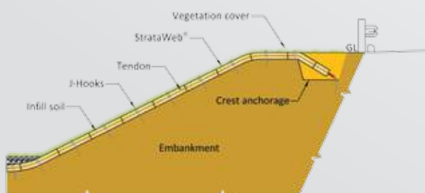
Schematic diagram for slope erosion control

StrataWeb® prevents slope soil erosion of embankments and dressed natural slopes. The panels are laid over the slope to be protected and anchored by spikes along the slope and or anchor trench at the crest. StrataWeb® panels are held together by StrataCord tendons and StrataLock clips. StrataWeb® cells may be either filled with soil that can be vegetated, or lean concrete.