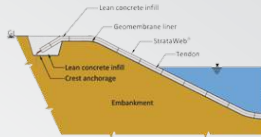
Schematic diagram for geomembrane protection on slope

In these applications, cells of StrataWeb® are generally infilled with lean M15 concrete. In case of landfill covers over geomembranes on outer slopes, infill of vegetated soil is preferred to give a green appearance.