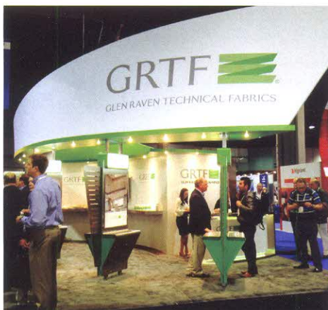
Technical Fabrics new trade show booth and corporate website.